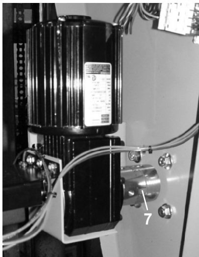
MOTOR AND GEAR BOX DETAIL

CAPACITOR WARNING! DISCHARGE CAPACITOR BEFORE REMOVING WIRES!