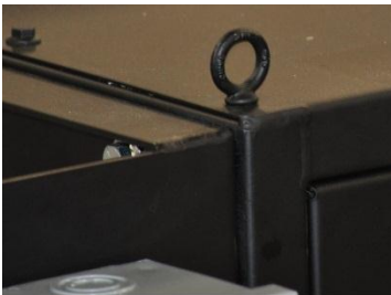
½-13 Eyebolt for Hanging