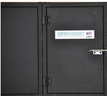
Filter Compartment: twist & pull spring loaded door latch for access to filter compartment