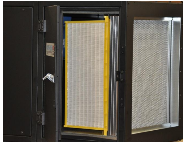
Access to Filter Compartment