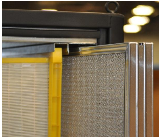
Aluminum Pre-Filter & Media Filter

Media Filters: Generally the media filters will have a long life with proper maintenance checks and regular pre-filter cleaning. The media filters life varies by work condition and usage. You will need to replace filter when a noticeable build-up of dirt and grime begin to form and or efficiency change happens to the unit.