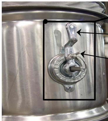
Illustration G: Hand Damper Assembly

To operate, loosen wing nut and move damper handle in 90° positions. Tighten wing nut to secure in proper position. Refer to illustration G.