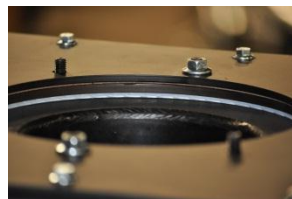
Swivel connection to platform