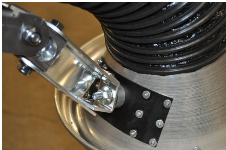
Illustration E: Receptor mounting to support bracket. The Friction disc is located on receptor side of bracket and spring washer and nut on the other side of bracket. Use a 9/16" wrench to tighten nut to the optimum tension needed.