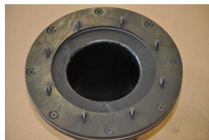
Top of Swivel