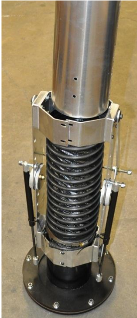
Illustration A: Arm Swivel Clamp with slotted holes to align with main support arm duct holes.